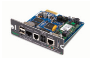
Schneider UPS Network Management Card 2 with Environment Monitoring, Out of Band Access and Modbus