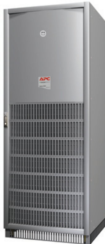
MGE Galaxy 5500 Battery Cabinet