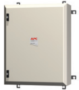
MGE Galaxy 5500 External Bypass Wallmount