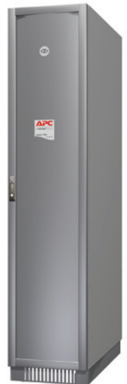
MGE Galaxy 5500 Transformer 80kVA-120kVA Standalone Cabinet