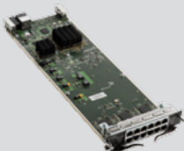
12-port 10/100/1000 Mbps Ethernet copper (RJ45)