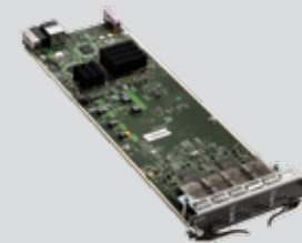
4-port 10 GbE fiber (XFP)