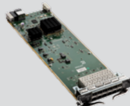
12-port 1 GbE fiber (SFP)