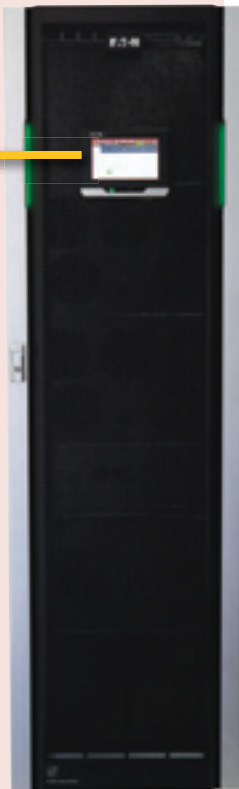
Eaton 93PM UPS

Benefit: The Eaton 93PM UPS offers a low cost of ownership through efficiency, reliability and ease of deployment.