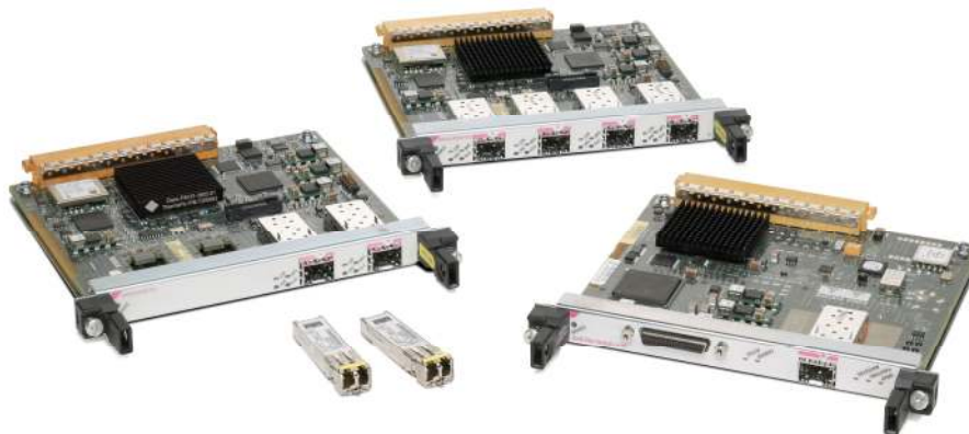
Figure 1. Cisco 2-Port OC-48c/STM-16c POS/RPR SPA with SFP Optics

The Cisco 1-, 2-, and 4-Port OC-48c/STM-16c POS/RPR SPAs are available on high-end Cisco routing platforms and offers the benefits of network scalability with lower initial costs and easy upgrades. The SPAs continues the Cisco focus on investment protection along with consistent feature support, broad interface availability, and leading-edge technology. The SPAs allow different interfaces (POS, ATM, etc.) to be deployed on the same carrier card.