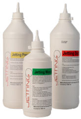
Lube & Pneumatic Oil