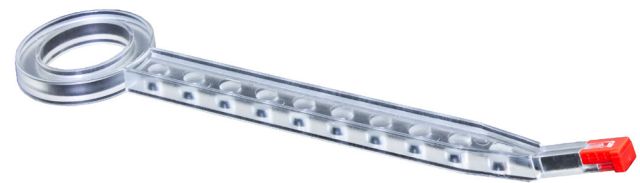
Boot Removal Key