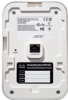
Figure 4. Side Panel of the WAP361 Wireless-AC/N Dual Radio Wall Plate Access Point