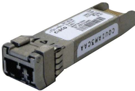
Figure 1. Cisco DWDM SFP+ Module

Main features of the Cisco DWDM Small Form-Factor Pluggable Plus (SFP+) module include: