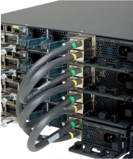
Figure 3. StackPower Connector

StackPower can be deployed in either power sharing mode or redundancy mode. In power sharing mode, the power of all the power supplies in the stack is aggregated and distributed among the switches in the stack. In redundant mode, when the total power budget of the stack is calculated, the wattage of the largest power supply is not included. That power is held in reserve and used to maintain power to switches and attached devices when one power supply fails, enabling the network to operate without interruption. Following the failure of one power supply, the StackPower mode becomes power sharing.