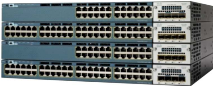
Figure 2. Cisco Catalyst 3560-X Series Switches

Table 2 shows the Cisco Catalyst 3560-X Series configurations.