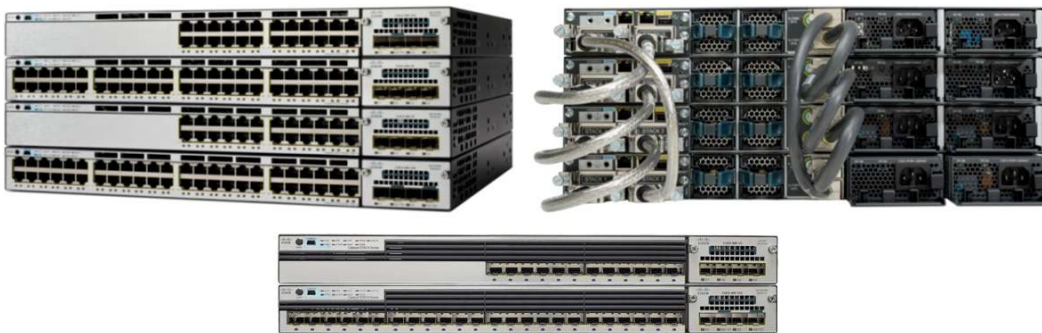
Figure 1. Cisco Catalyst 3750-X Series Switches (Front and Back)

Table 1 shows the Cisco Catalyst 3750-X Series configurations.